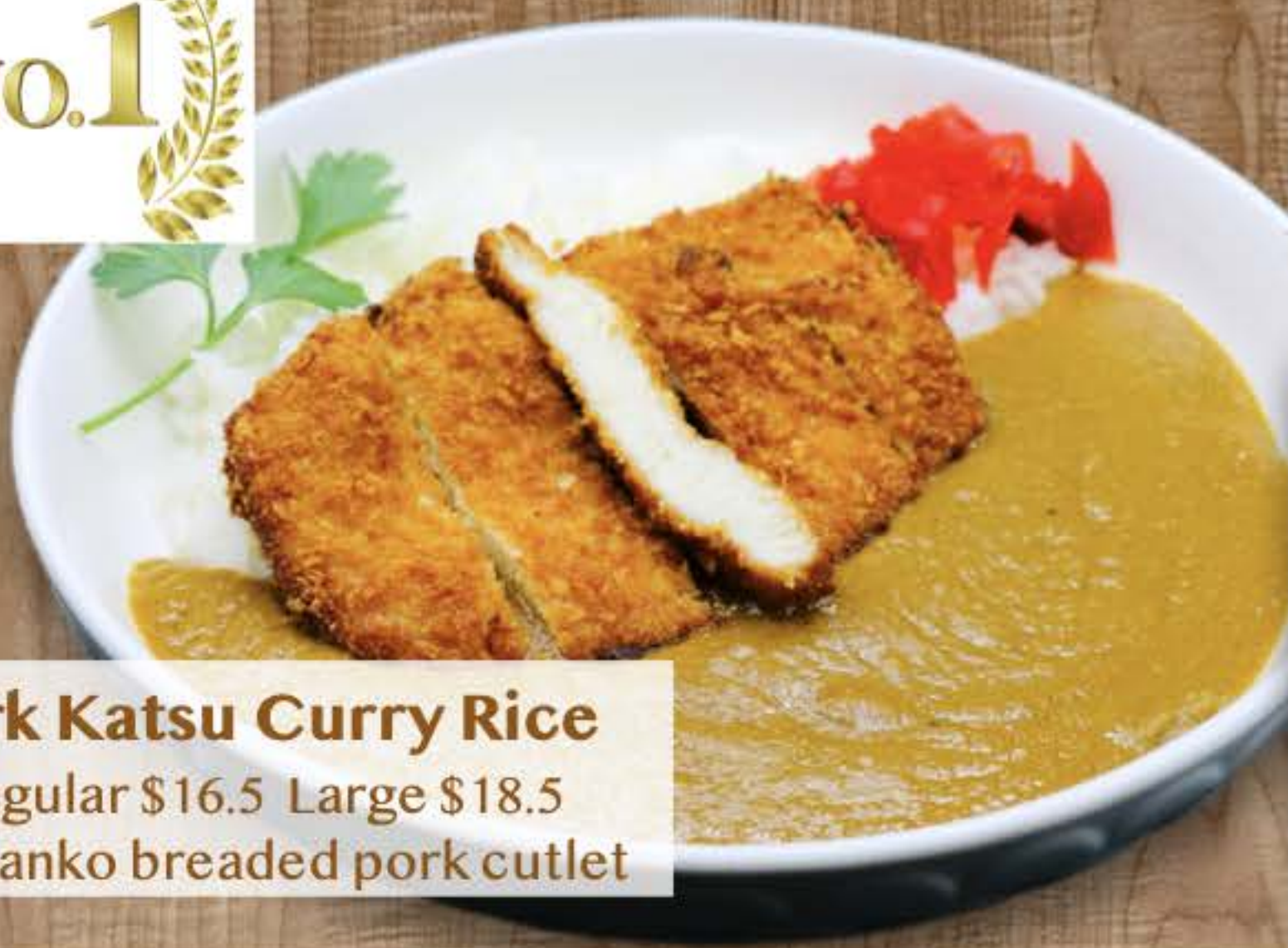
Pork Katsu Curry Rice Regular $16.5 Large $18.5 1pc panko breaded pork cutlet