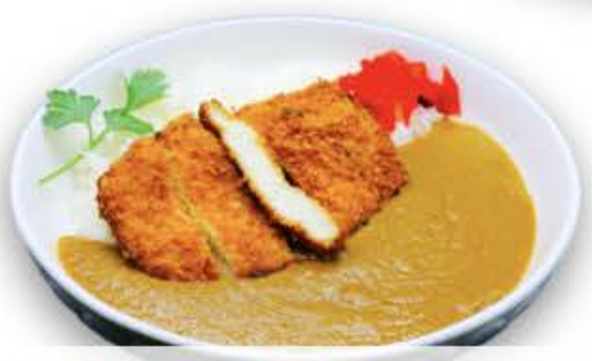
Chicken Katsu Curry Rice Regular $16.5 Large $18.5 1pc panko breaded Chicken cutlet