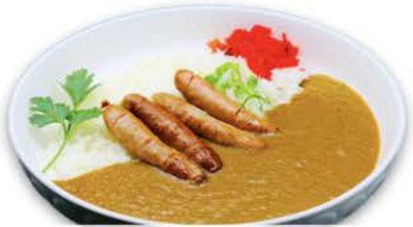
Pork Sausage Curry Rice Regular $15.5 Large $17.5 4pcs of pork sausage topped with green onion