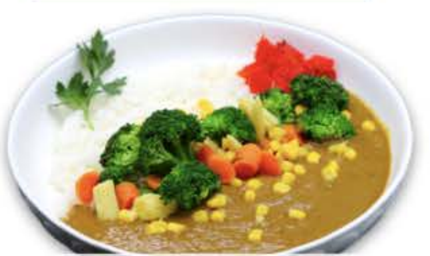
Steamed Veggies Curry Rice Regular $15 Large $17 Steamed mixed vegetables