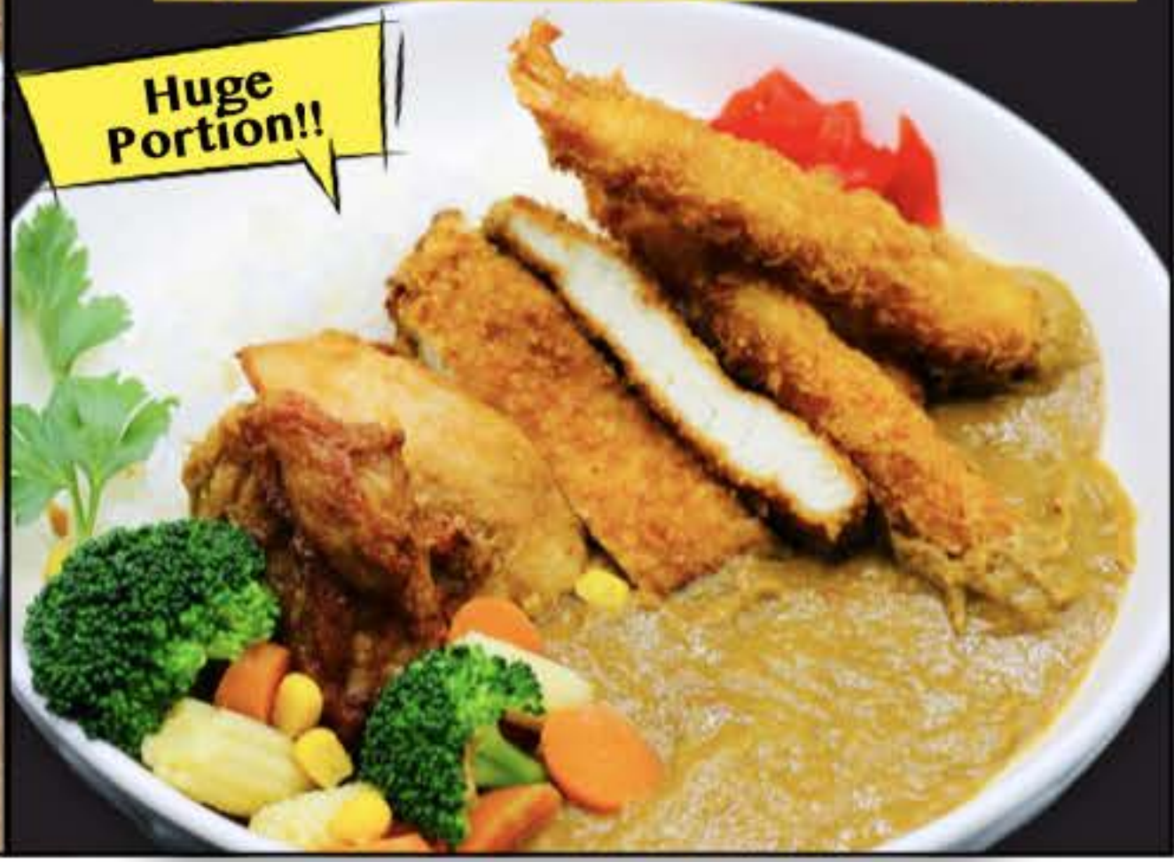
Campion Curry Rice Regular $24 Large $26 1 pc pork cutlet, 2pc chicken karaage, 2pcs fried shrimp & steamed veggies