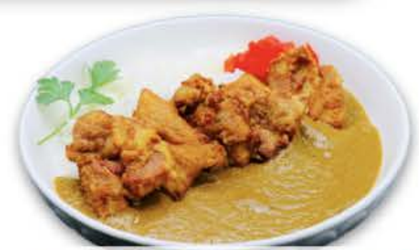
Karaage Chicken Curry Rice Regular $16.5 Large $18.5 5pcs of boneless fried chicken