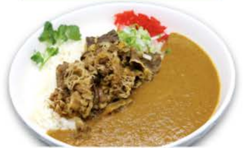
Beef Sukiyaki Curry Rice Regular $16.5 Large $18.5 Simmered beef & white onion topped with green onion