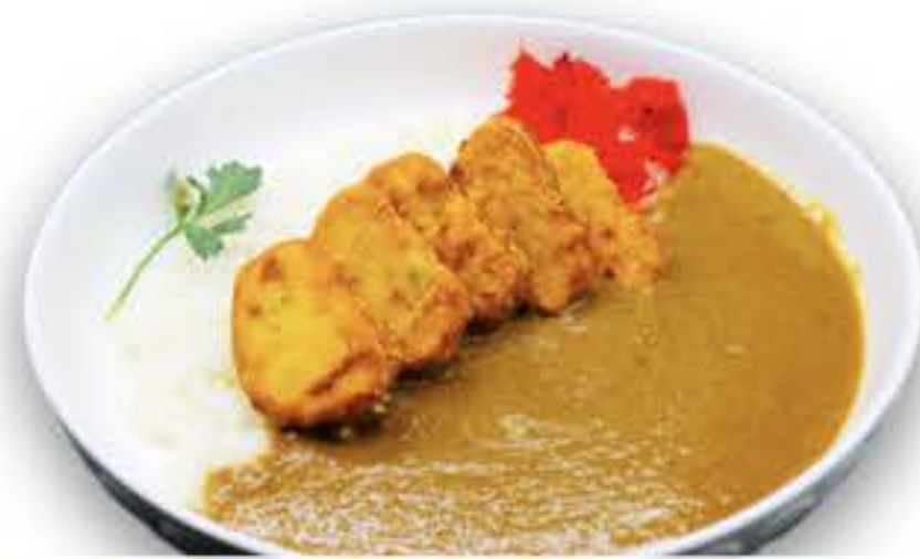
Tofu Nugget Curry Rice Regular $15.5 Large $17.5 5pcs of tofu nuggets