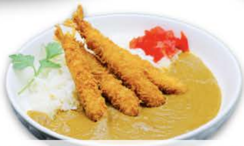
Ebi Fry (Shrimp) Curry Rice Regular $16.5 Large $18.5 4pcs of fried shrimp