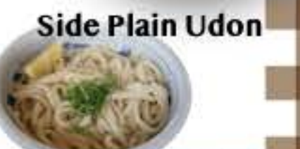
Side Plain Udon